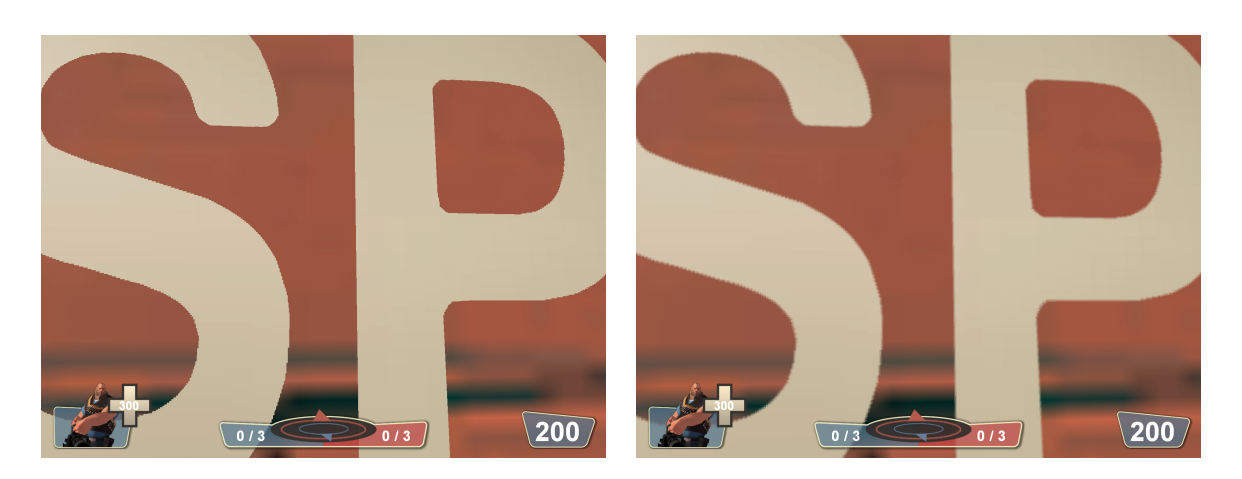
Figure 4: Zoom of 256x256 "No Trespassing" sign with hard (left) and softened edges (right)

renderings than mere alpha testing, at the expense of requiring custom fragment shaders.