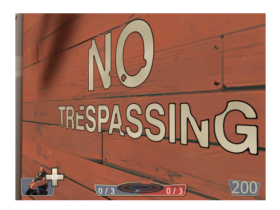
Figure 5: Outline added by pixel shader

When the alpha value is between the threshold value of 0.5 and 0, the smoothstep function can be used to substitute a "halo" whose color value comes from a pixel shader constant as shown in Figure 6. The dynamic nature of this effect is particularly powerful in a game, as designers may want to draw attention to a particular piece of vector art in the game world based on some game state by animating the glow parameters (blinking a health meter, emphasizing an exit sign etc).