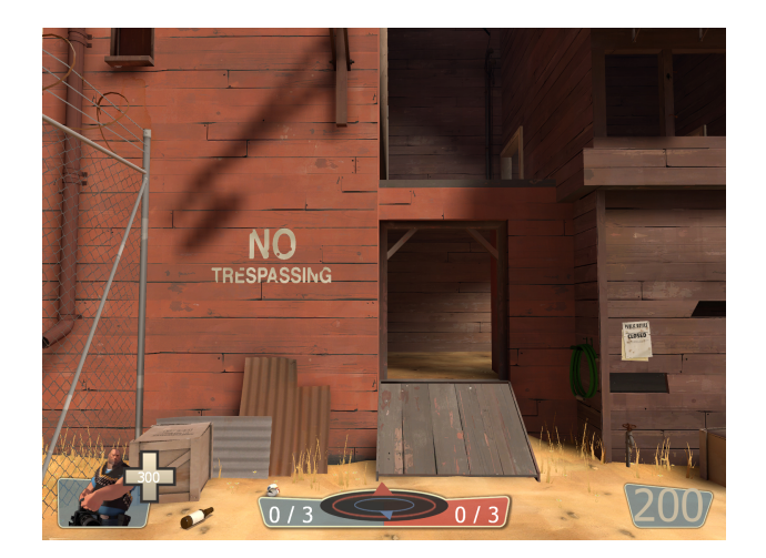
Figure 3: 128x128 "No trespassing" distance image applied to a surface in Team Fortress 2

In the simplest case, the resulting distance field textures can be used as-is in any context where geometry is being rendered with alphatesting. Under magnification, this will produce an image with highresolution (albeit, aliased) linear edges, free of the false curved contours (see Figure 1b) common with alpha-tested textures generated by storing and filtering coverage rather than a distance field. With a distance field representation, we merely have to set the alpha test threshold to 0.5. Since it is fairly common to use alpha testing rather than alpha blending for certain classes of primitives in order to avoid the costly sorting step, this technique can provide an immediate visual improvement with no performance penalty.