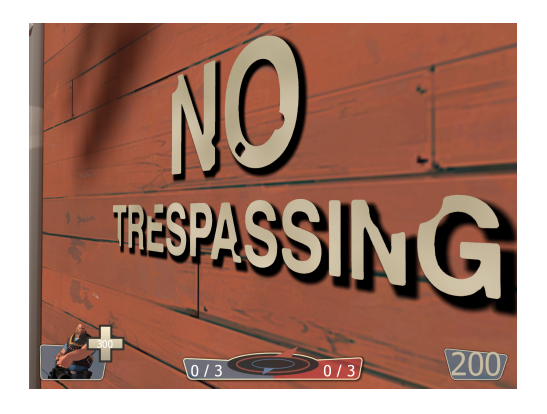
Figure 7: Soft drop-shadow added by the pixel shader. The direction, size, opacity, and color of the shadow are dynamically controllable.