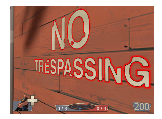
Figure 6: Scary flashing "Outer glow" added by pixel shader