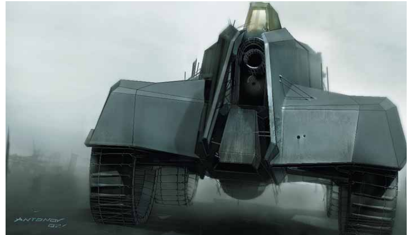
Combine APC Viktor Antonov

The APC was originally a player driven vehicle. Playtesters found that the slow movement wasn’t as satisfying as the Buggy, and the APC was recast and used by the Combine forces only.